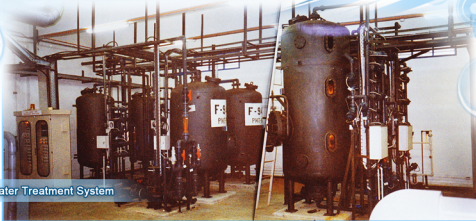
Pure Water Treatment System