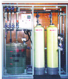
Portable Deionised Water Unit

Glory Water is capable of designing and supplies small to large scale systems to meet your requirements. Our process stages cover the pretreatment, demineralization, fine purification and final polishing. Besides, Glory Water offers modular service packages tailored to your needs to ensure a continuous compliance of the water quality.