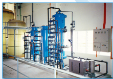
Pure Water Treatment System